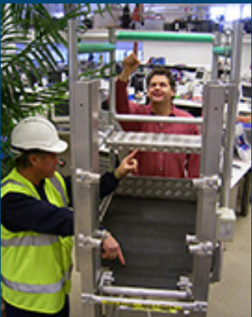
Option 2,3 & 4